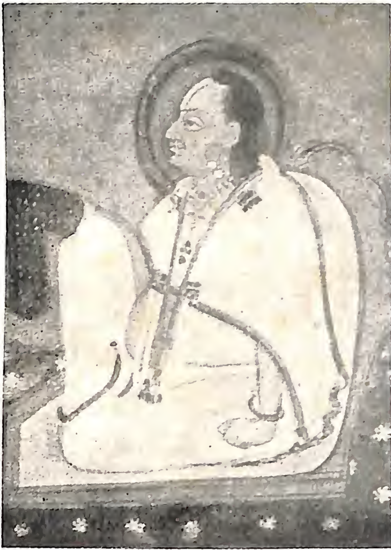
Goswami Shri Yogi Gopeshwaraji See page 346